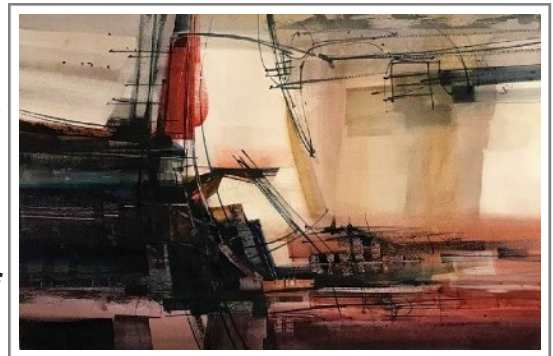
“Schooner at Dawn” 2019 NJWCS Nummie Warga Award winner