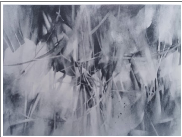
"Within II" in 50th Anniversary Show.