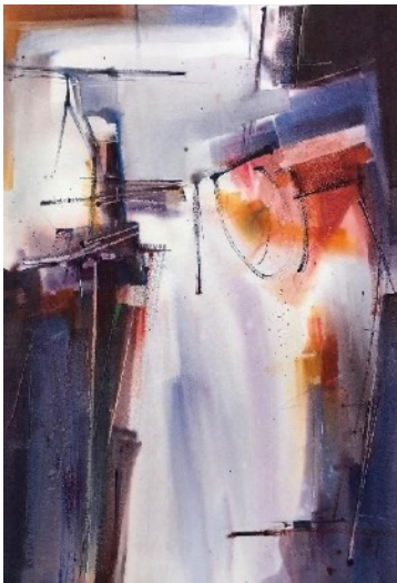
“Song of the Sun”.