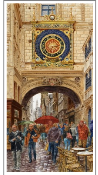
“Rainy Day in Rouen”