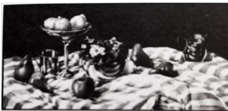
Reflections (14" x 28")

objects that she paints. She delights in the way they combine and interact with one another and in how light affects them. A former textile designer(1970's), Florence has an affinity for texture and surfaces and finds that rendering cloth, glass and silver presents interesting challenges. Flowers and fruit add warmth and life to her works, while opaque black backgrounds emphasize negative space and produce a dramatic contrast.