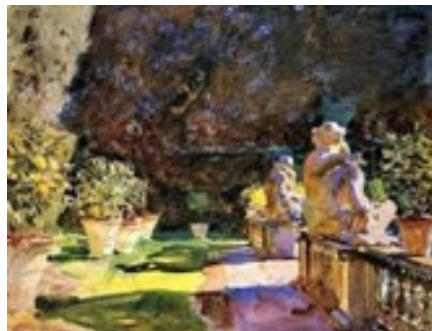
John Singer Sargent